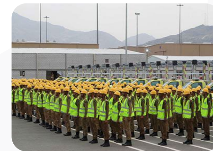
Managing Crowds Solutions such as Hajj (Pilgrimage)