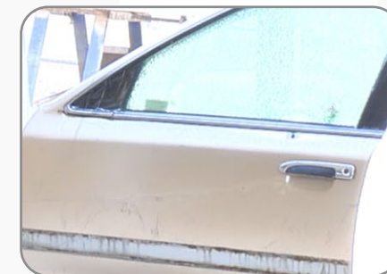
Fiberglass Armor Board