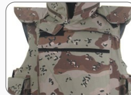
Arming Individuals Solutions