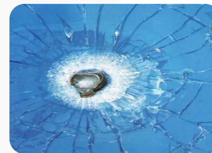
Arming Vehicles Solutions