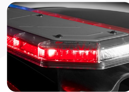
Safety Lightbars and Sirens for Security Vehicles