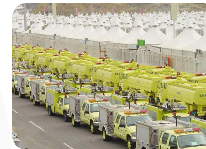
Civil Defense Solutions