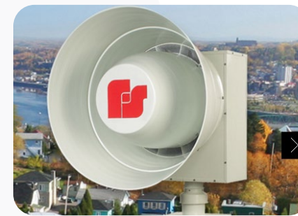
Early Warning Sirens Solutions