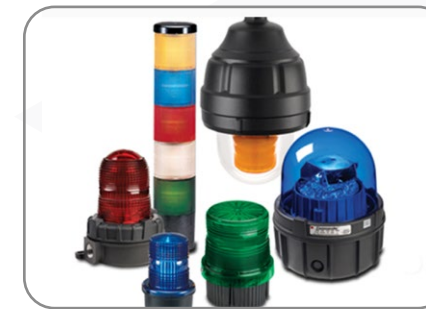
Industrial Safety and Security Solutions

(Attached with this booklet a video for the test of the Armed Glass and the Fiberglass Boards provided by the Saudi Public Security)